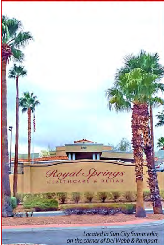
Located in Sun City Summerlin, on the corner of Del Webb & Rampart.

ROYAL SPRINGS IS A 225-BED SKILLED NURSING AND REHABILITATION FACILITY LOCATED IN SUN CITY SUMMERLIN, OFFERING A WIDE VARIETY OF SERVICES. MEDICARE, MEDICAID AND MOST INSURANCES ACCEPTED. THE STAFF TAKES PRIDE IN PROVIDING QUALITY NURSING CARE.