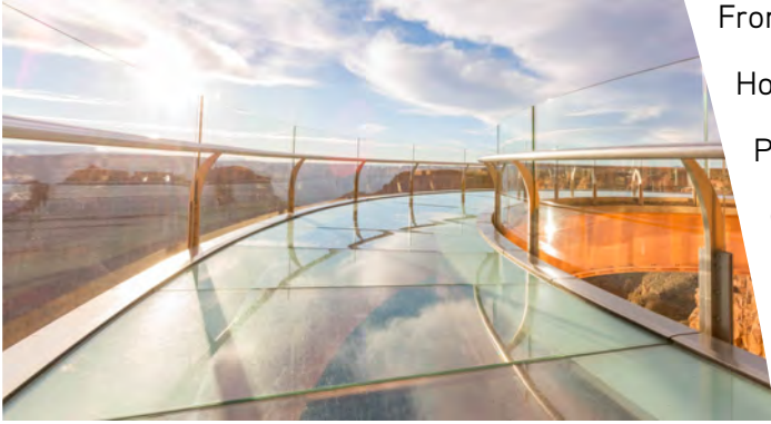
Page 10. Don't miss your chance to experience the Grand Canyon from Skywalk. Tickets on sale through September 25. Trip date, Thursday, September 28.