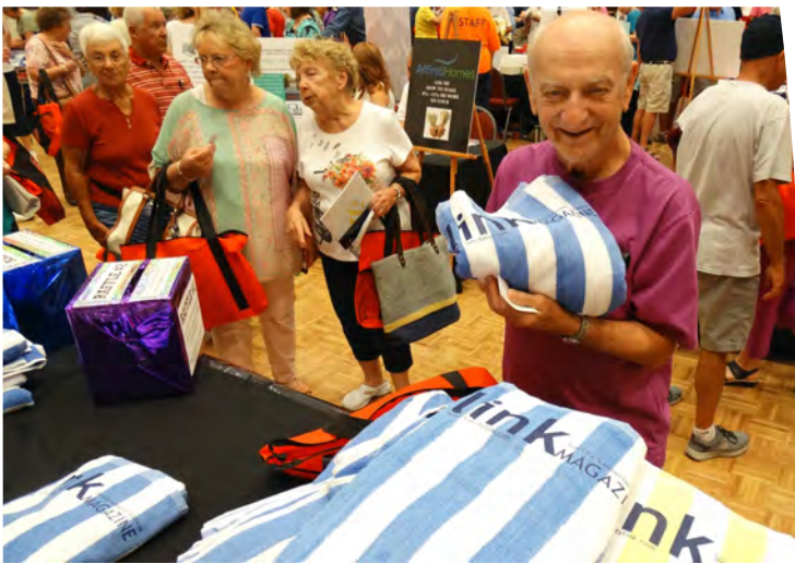
Page 26. More than 500 residents turned out to meet with Link advertisers during the magazine's 2nd Annual FANFARE. Information exchange, table giveaways and raffle drawings were a part of the morning's festivities. See Community News for more information on what's happening in Sun City.